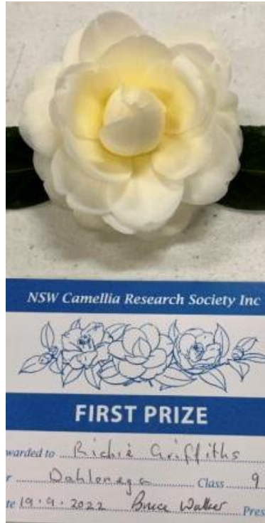
Formal Double Dahlonaga Richie Griffiths