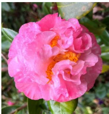
Tomorrow Park Hill