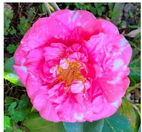
R.L. Wheeler Variegated