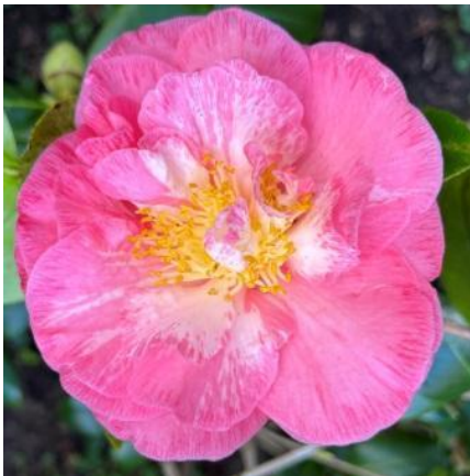
Carter's Sunburst Pink