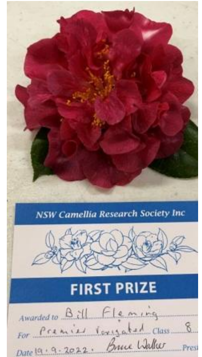
Informal Double Premier Variegated Bill Fleming