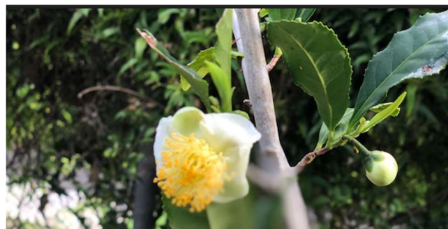
Camellia Tea plant Camellia sinensis