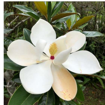
Little Gem Magnolia