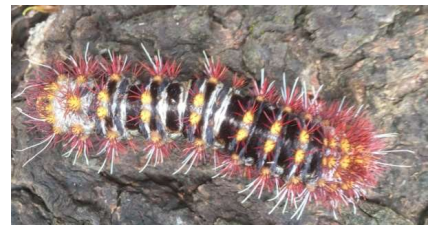
White-stemmed Gum Moth