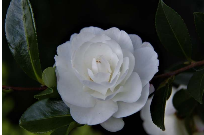
'Early Pearly' Camellia sasanqua - an early bloomer in the season.