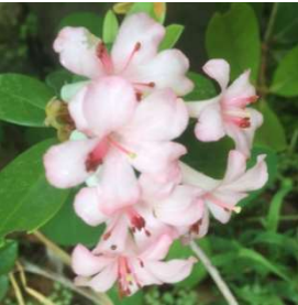
3 Vireya Rhododendrons