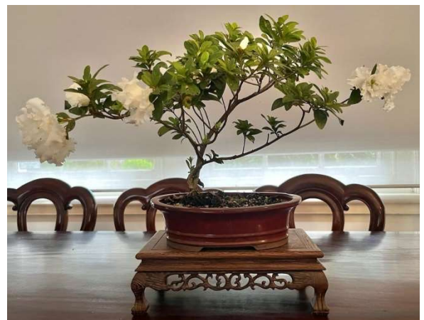
Satsuki Azalea Bonsai