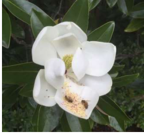
Bull Bay Magnolia and Friends