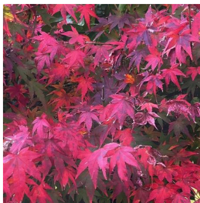
A Cut Leaf Maple