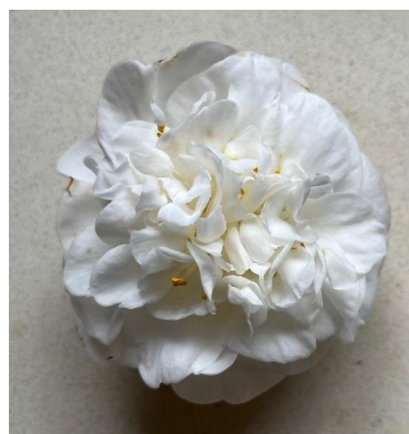
Camellia japonica 'Gwynneth Morey'