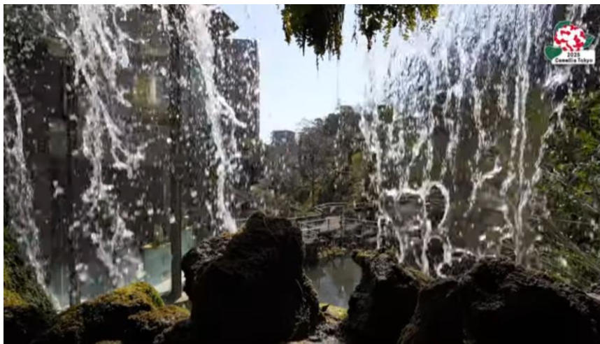
The View Overlooking the Chinzantso Gardens