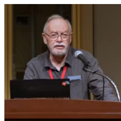
My Scientific Presentation