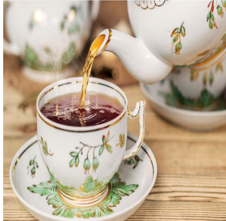
A Refreshing Brew of Camellia Leaves