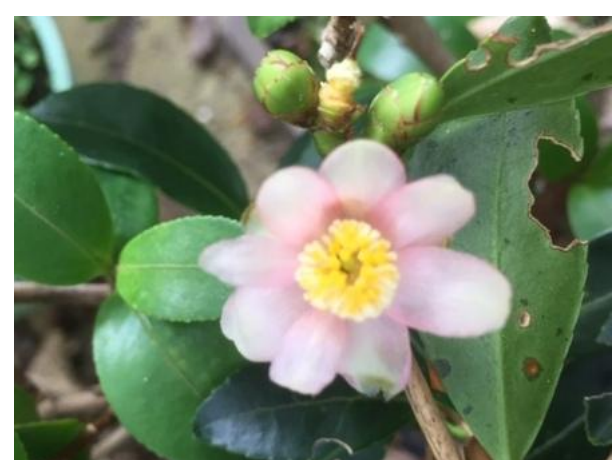
The plant looked as if it would be a good subject for bonsai and now we can see the beautiful miniature flowers and leaves of C. puniceiflora