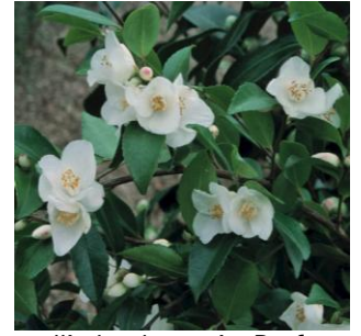
Camellia lutchuensis--Perfumed C.