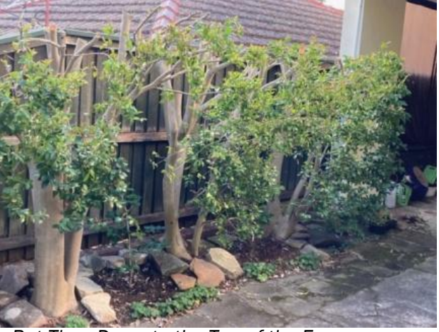
Initially 300mm Above, But Then Down to the Top of the Fence