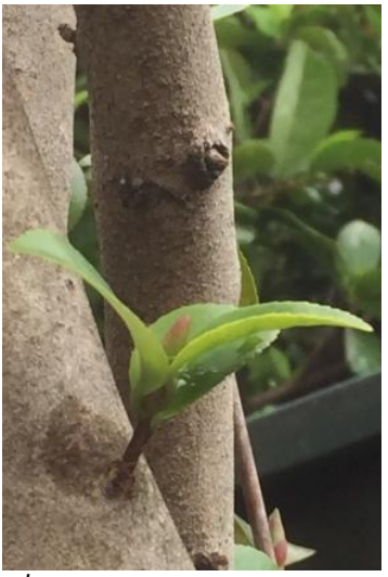
Within a Fortnight Epicormic Buds Appeared

[Wanting to have clean cuts and to expend less effort, we (i.e. The Editor has come into possession of a Stihl Chainsaw lopper). This marvellous machine is light enough to manipulate in and around adjacent limbs, the chain is fine enough to produce clean surfaces and being battery powered it is nearly silent, lighter than a petrol motor and there are no exhaust fumes.]