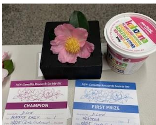
Open Champion Bloom