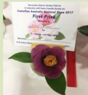
C. j 'Grape Soda'