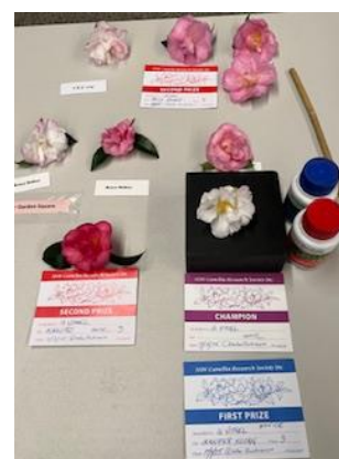
Class 2 and Novice Champion