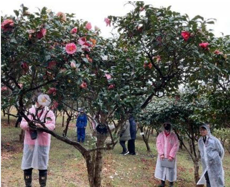
The School Garden