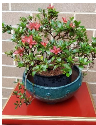
From Laurella Cross: