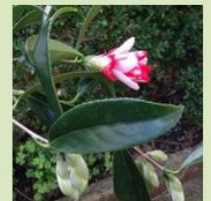
C. j 'Hakuhaku-kujaku'