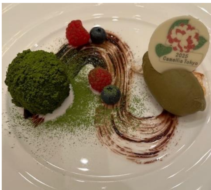
Macha Mousse and Camellia Tea Ice Cream