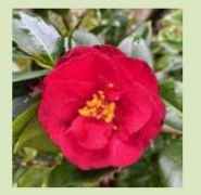
C. j 'Susie Fortson'

Sports abound in the camellia world, but we were mainly collecting those from Australia and New Zealand, with the exception of a number from Nuccio's Nursery in California. These are all varieties of Camellia japonica .