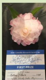
C. j 'Buttons 'N' Bows'