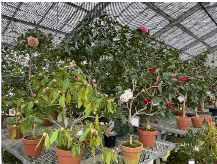
One of the School's Green Houses