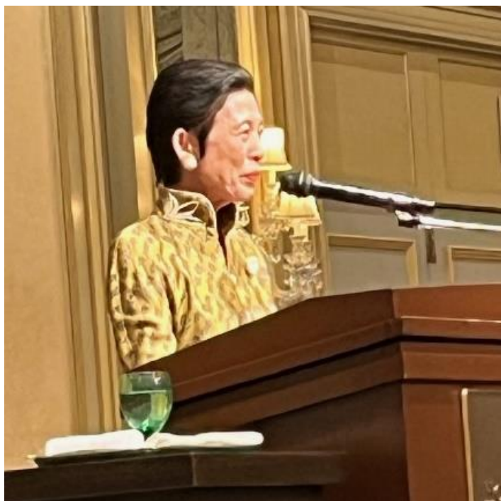
Her Imperial Highness Princess Hisako Takamado