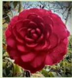
'Roger Hall Variegated'