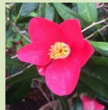
C. j 'Nokogiriba Tsubaki'