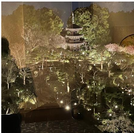
Hotel Chizanso Garden at Night

Then it was time to get ready for the Welcome Party where the Guest of Honour was, Her Imperial Highness Princess Hisako Takamado. The Dinner was a six-course degustation featuring: Amuse-bouche, Hors-d'oeuvre, Poisson, Viande, Dessert, Café ou Thé and finally Petits Fours.