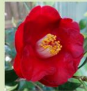
C. j 'Wild fire'