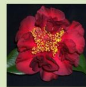
C. j 'Imperial Splendour'