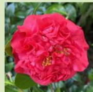
C. j 'Firefalls'