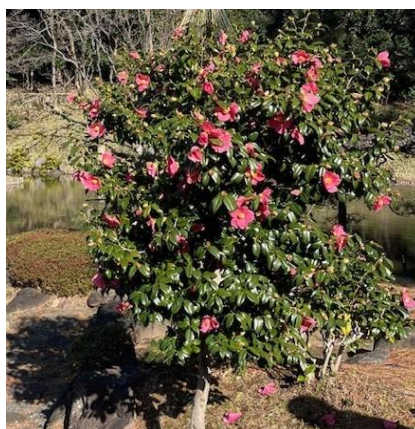
Camellia in the Garden