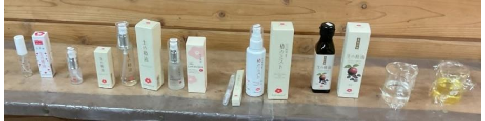
Camellia Oil Products