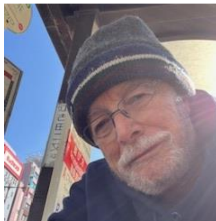
"It was A Cold and Windy Day"