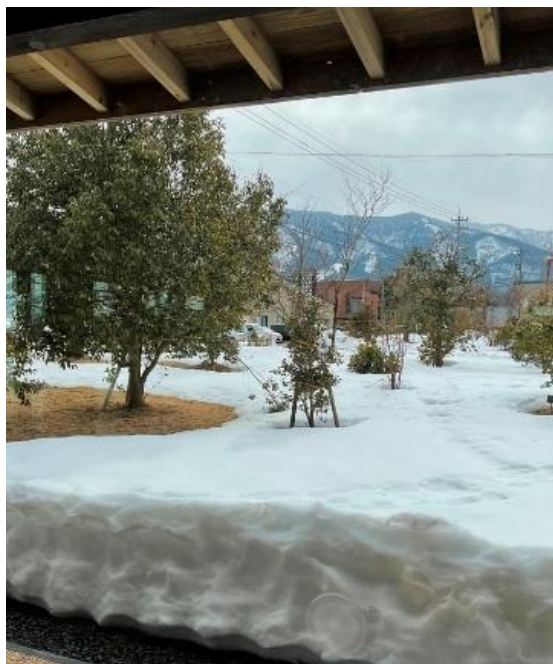
Sixty Centimetres of Snow

The International Camellia Society met for its biennial congress in Tokyo, and Juliet and I were among some 170 participants. The only countries with a larger contingent were China and Japan. Juliet went on the pre-congress tour to Oshima Island, where it had snowed the previous day (see photo of snow 60cm deep).