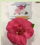
C. j 'Drama Girl'