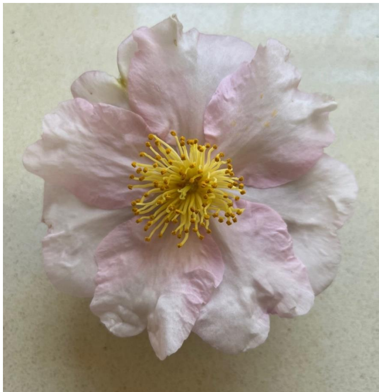
Camellia sasanqua 'Exquisite Waterhouse'