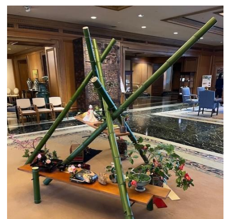
The Ikebana Display in the Hotel Lobby

Then it was time to get ready for the Welcome Party where the Guest of Honour was, Her Imperial Highness Princess Hisako Takamado. The Dinner was a six-course degustation featuring: Amuse-bouche, Hors-d'oeuvre, Poisson, Viande, Dessert, Café ou Thé and finally Petits Fours.