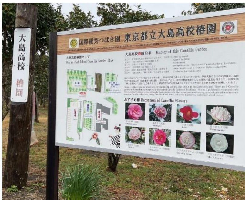
Oshima High School