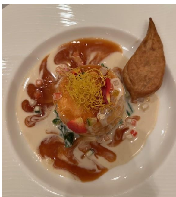
Marinated Scottish Salmon With Camellia Oil Sauce

Monday from 8.30 to 4.30 was taken up with the various sessions and presentations. Session 1 was the Scientific Session from 8.30 until 10.00 with a coffee break at 10.00, lunch at 12.00 and another coffee break at 2.30.