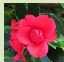
C. j 'Kifukuren-benikarako'