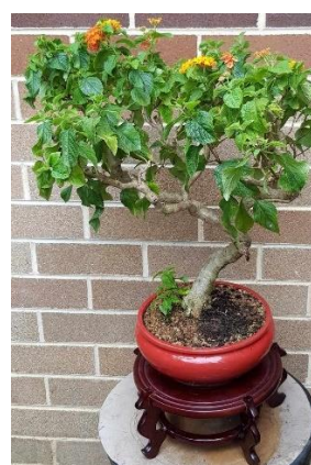
Lantana camara 'Chelsea Gem'