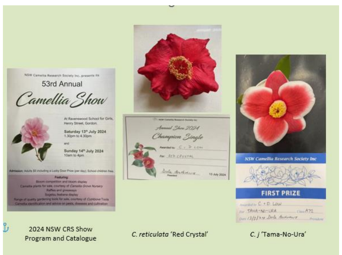
C. reticulata 'Red Crystal'