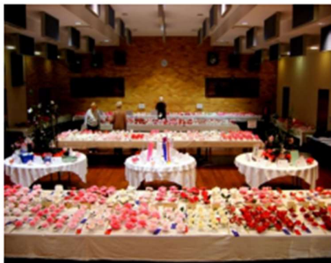
NSW Camellia Research Annual Show Held in Gordon, NSW