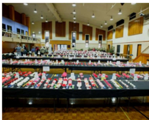
Camellias Illawarra Annual Show Held in Wollongong, NSW