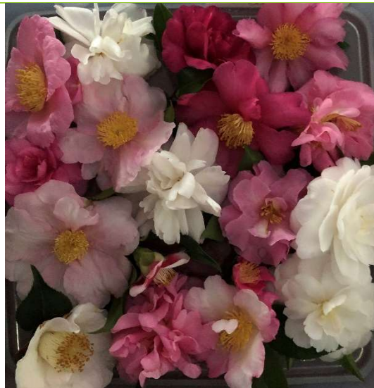
A selection of camellia blooms on display at the April meeting.

Looking forward to seeing everyone soon at our meeting on 15 May. Details below.