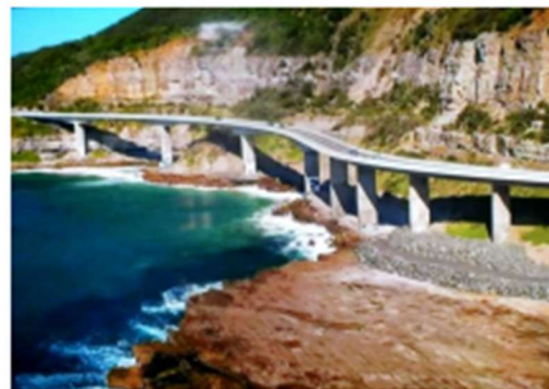
Grand Pacific Drive and Sea Cliff Bridge Wollongong (Jim Powell)