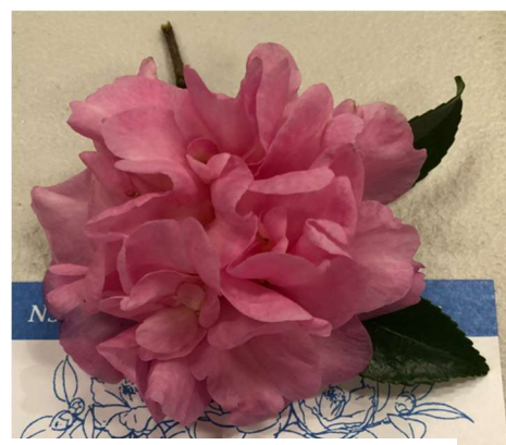
C. sasanqua 'Jennifer Susan'