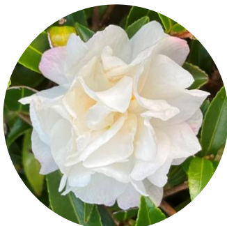
Slim 'N' Trim