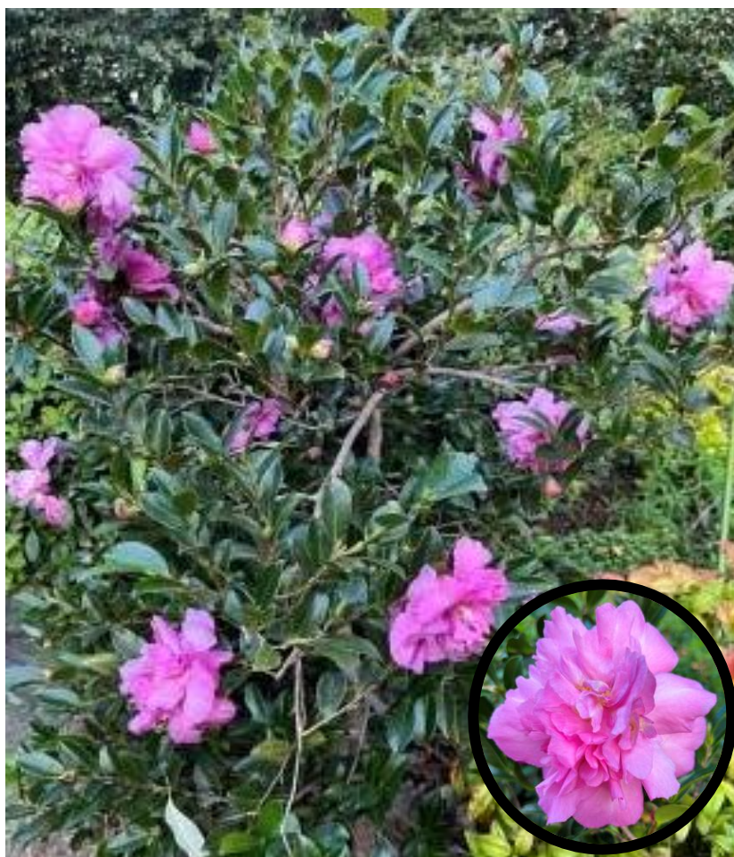
'Burghundy Blush' – not a "Blushing Beauty"

The April meeting is coming up on TUESDAY 26 th