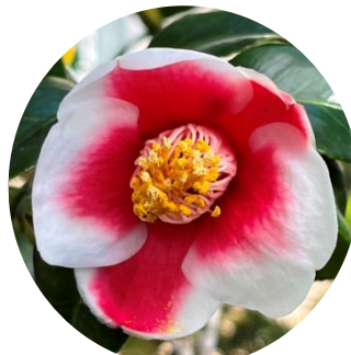
Tama No Ura