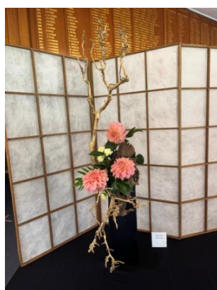
Part of the members' display: