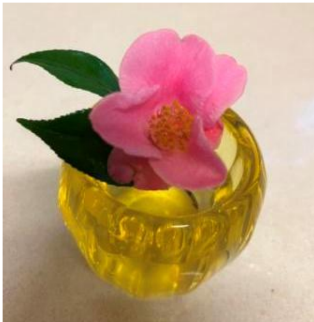
Miinato No Akebono